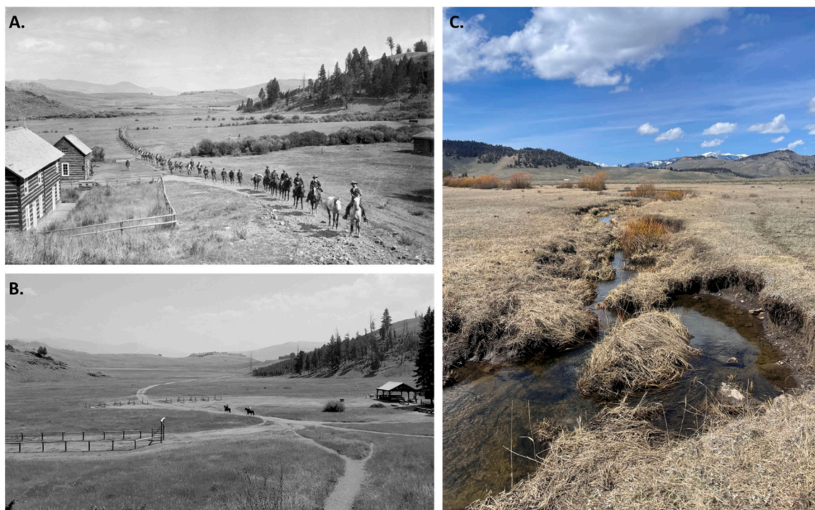
Fig. 3. Historical and contemporary photographs illustrating the long-term absence of willow ( Salix spp.) recovery in parts of northern Yellowstone National Park. (A) A view of Yancey's Hole in 1890 showing extensive willow cover along the riparian corridor and around historic structures and trails. (B) The same location photographed in 2017, showing a persistent lack of willow regeneration despite more than two decades of large carnivore recovery, including wolf reintroduction. (C) A 2025 downstream view of the East Fork of Blacktail Deer Creek, where multiple riparian areas similarly show minimal to no visible willow crown development. These counterexamples contrast with the selectively framed photographic evidence in Ripple et al. (2025), which emphasized sites with vigorous willow recovery while omitting locations like these, where recovery remains limited or absent. The persistent absence of regeneration highlights the spatial heterogeneity of willow responses and challenges claims of a strong, system-wide trophic cascade across northern Yellowstone.

If any of these 19 plots had larger crown volumes in 2001 than the three measured plots, and grew larger by 2020, their inclusion in the 2020 average would exaggerate the increase in crown volume and inflate the log response ratio. This inflation plausibly contributed to Ripple et al.'s conclusion of a strong trophic cascade. More fundamentally, the estimated effect size conflates ecological change with sampling bias, undermining its validity as a measure of trophic cascade strength.