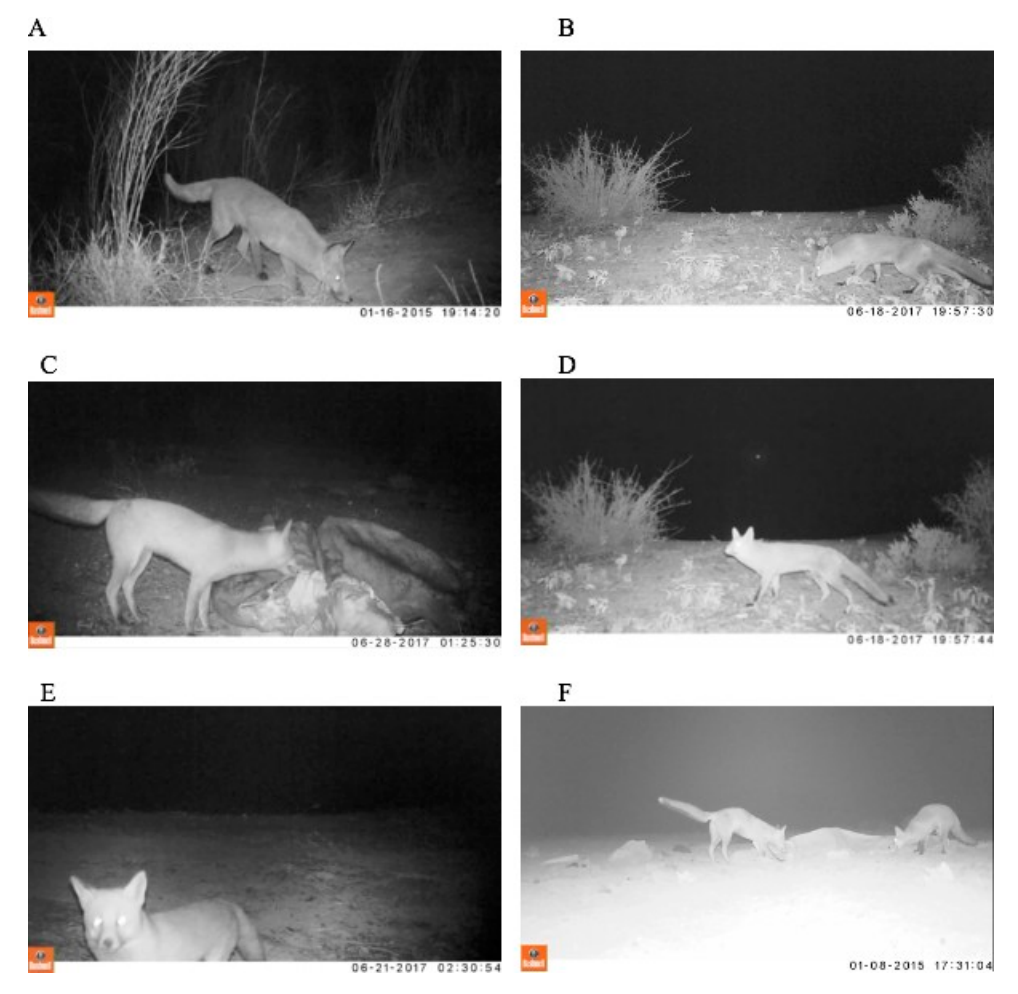
Figure 1. Behaviours observed in this study and used to classify fox behaviour: ( A ) confident sniffing and walking, ( B ) cautious sniffing and walking, ( C ) confident scavenging, ( D ) high vigilance, ( E ) cautious camera investigation, ( F ) social foraging. See supplementary material 1 for an example of behaviourally scored video.

Fox social behaviour comprised of two pairs at two carcasses, lasting in total for 5.10 minutes. Fox pairs spent the highest average proportion of their time sniffing (43%), followed by locomotion (33%) and foraging (27%). During this time, they played (n = 6), greeted one another (n = 5), and scent marked (n = 4).